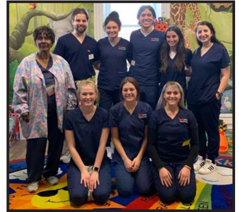
Thank you, Maryville University Nursing students who spent the day organizing donations, cooking lunch and helping in the Nursery!