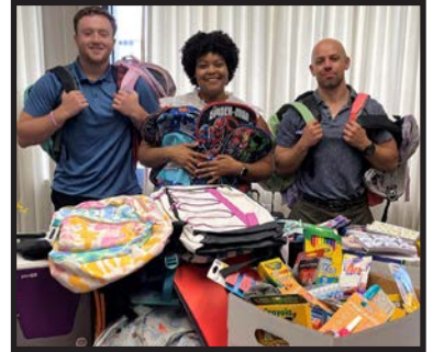
Premiere Business Brokers