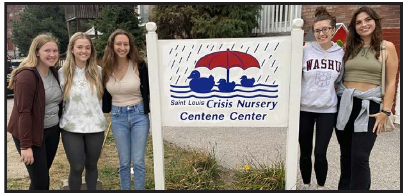
The ladies from Gamma Phi Beta at Washington University in St. Louis are such great supporters of our mission and were willing to help with whatever is needed. These incredible and hard-working women created 35+ food bags for our families and community, and organized the supplies for families! Thank you, we are grateful!!!