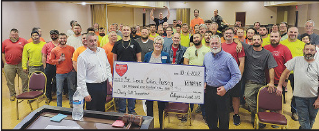
Glaziers Local 513 recently presented the Saint Louis Crisis Nursery with a check for $10,966.45, proceeds from its charity golf tournament in August at Florissant Golf Club.