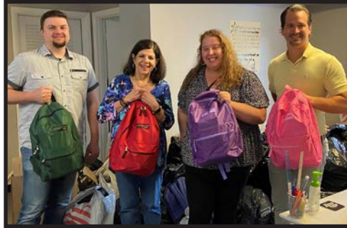
Guild Mortgage Company-Midwest Region