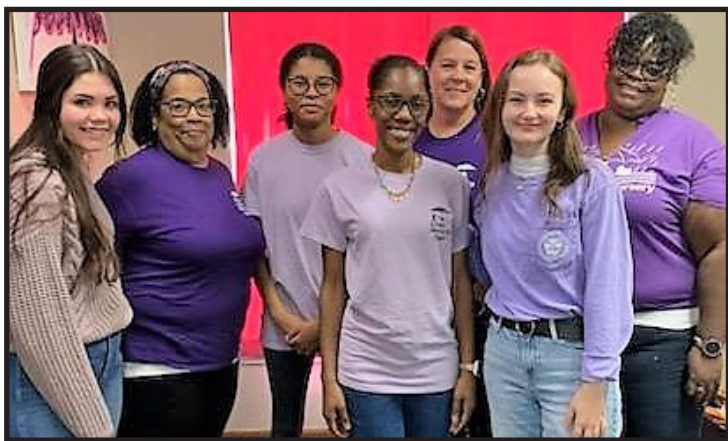
Top Picture: Crisis Nursery staff enjoy dressing up for Halloween to make the kids smile! Bottom Picture: Staff dress in purple to recognize Domestic Violence Awareness!

Happy 14th year to our Wentzville Nursery! We love seeing our team and community come together to celebrate! In the past 14 years, the Crisis Nursery - Wentzville has cared for over 18,200 children and offered support to nearly 10,000 families!! Many thanks to Community and Children's Resource Board, Lincoln County Resource Board and SSM Health St. Joseph Hospital - Wentzville for 14 years of helping the Crisis Nursery Keep Kids Safe.