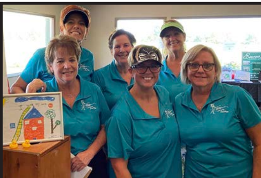
What a great event to benefit the Crisis Nursery! The "Ladies Swinging Fore Hope" golf tournament raised $13,000 and was held at Incline Village Golf Courses in Foristell. Such a wonderful generous group of women — thanks for supporting the Crisis Nursery!