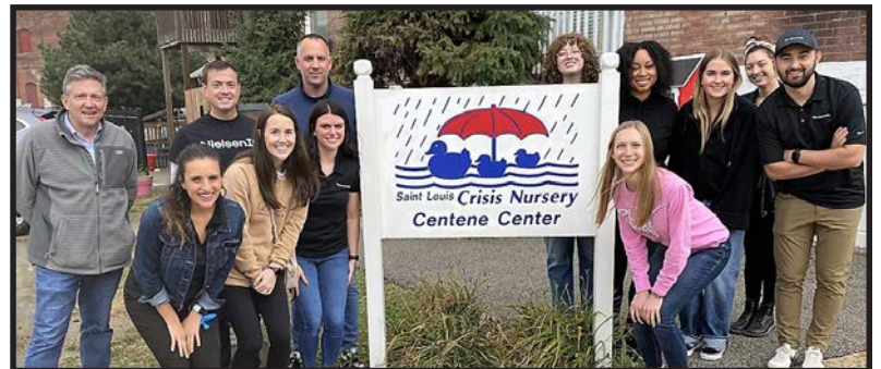
This hard-working group from NielsenIQ was able to create over 80 food bags for our families, and package over 1,060 wipes for our families/community, PLUS they built a storage shelf, changed our basement door locks, AND sorted through summer and winter clothes. They got SO much accomplished in the 3 hours that they were here!! Thank you!