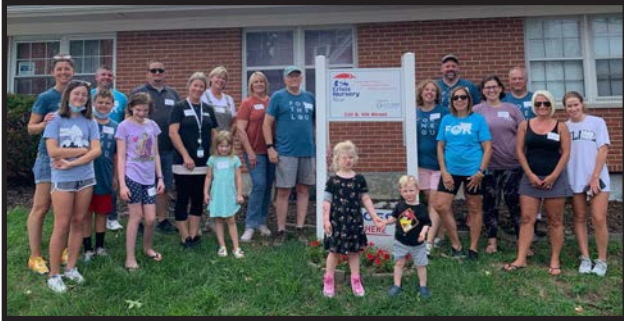
The Crossing Outreach

Because of the many, many Crisis Nursery supporters who know that EVERY child deserves to start the school year with a Brand New Backpack, we have great news: 850 kids in the metro area were able to walk into the classroom on the first day of school feeling strong and confident loving their new backpack. The Crisis Nursery is all about reducing parental stress, and a new backpack for their student can help mom & dad feel better and more relaxed too! Thank you to the individuals, businesses, churches and social groups who donated backpacks and school supplies.