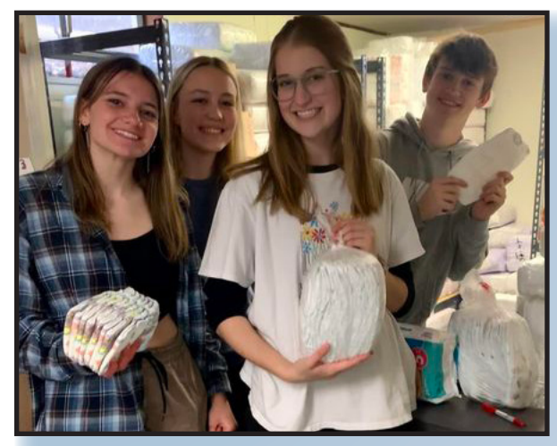
FCCLA students from St. Charles High School organized donations and assembled diaper giveaway bags for our families in need.