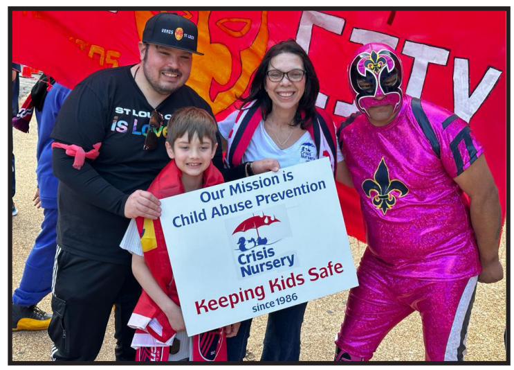
Muchas Gracias to STL Santos for selecting the Saint Louis Crisis Nursery as their charity of the month. STL Santos is a Latino supporters group of the St. Louis CITY SC, and all funds raised at home and away games in April will help the Crisis Nursery's Latinx Outreach Program!

The caring and dedicated staff at the Crisis Nursery-North location have hugged and loved more than 30,000 children, wiped THOUSANDS of tears, and listened to MILLIONS of laughs and stories and hopes and dreams of the children who have come to the Nursery to stay safe. Thank you to the amazing team at the North Nursery, and to all our staff, for giving your hearts to children every day.