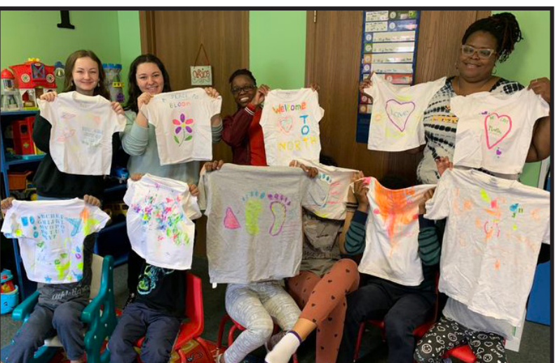
Crisis Nursery North Staff and Students spent a fun day in the Nursery with the children decorating T-Shirts for them to take home! One of MANY creative activities Crisis Nursery Staff do with the children every day!