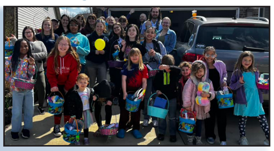
St. Charles Jaycee's put together fun Easter Baskets for the children of the Crisis Nursery! The kids are going to LOVED them!