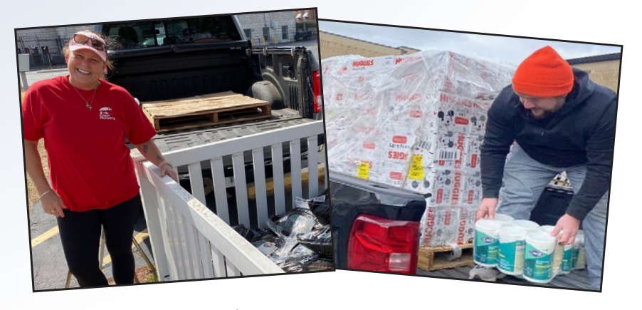
Scott and Carrie are two of our very special Transport Volunteers! Scott picked up and delivered two pallets of diapers, and disinfecting wipes to keep our Nurseries clean! Carrie made several trips to pick up food to stock our pantry; and then brought a truckload of mulch for the kids' playground! Thank you Scott and Carrie!