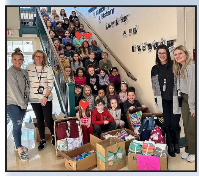
The Kindness Club from Lincoln Elementary in St. Charles! Thank you for being so kind to the Crisis Nursery Kids!